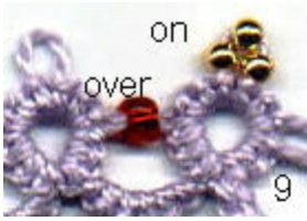
9 lesson illustration